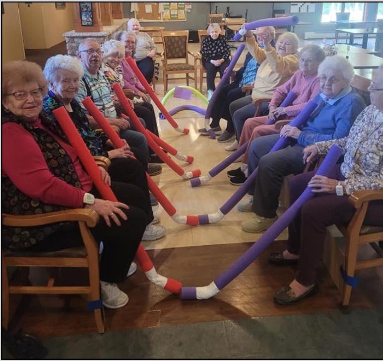
Pool Noodle Hockey, Banana Splits & Ring Toss oh my!

Cornerstone Residence 30 Sunset Avenue Bagley, MN. 56621